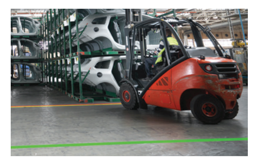
Stands up to forklift traffic, pallets and heavy equipment.