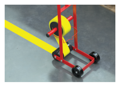
Liner-less format for easier application by hand or with 3M™ Lane Marking Applicator M-1.