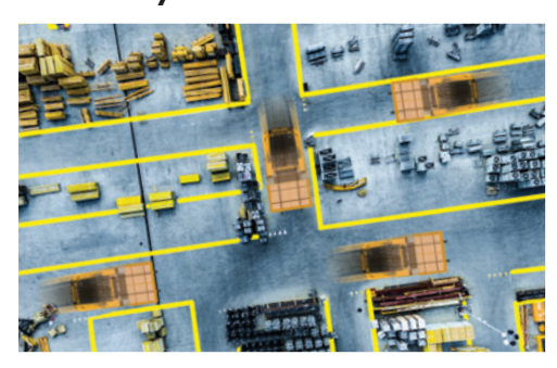
Extreme durability for high-traffic areas.